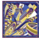
NY New York