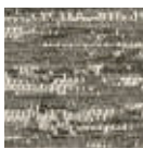
2 dove grey