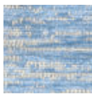
3 sky blue